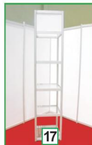
17 ILLUMINATED DISPLAY TOWER WITH LOGO PANEL 50(L) x 50(W) x 240 (H)cm