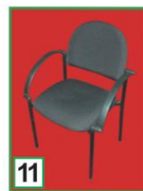
11 ARM CHAIR (CUSHION) 59(W) x 52(D) x 45(H)cm