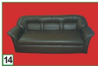
14 LEATHER SOFA - 3 SEATER 190(W) x 80(D) x 44(H)cm