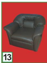
13 LEATHER SOFA - 1 SEATER 100(W) x 80(D) x 40(H)cm