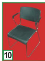
10 FOLDING CHAIR (S.S.) 52(W) x 54(D) x 43(H)cm