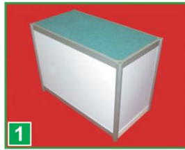
1 INFORMATION COUNTER 100(L) x 50(W) x 75(H)cm