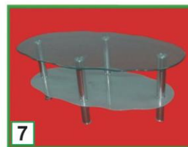
7 SIDE TABLE (GLASS TOP) 45 (L) x 45 (W) x 60(H)cm