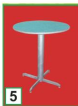
5 ROUND TABLE (WOOD & STEEL) 70(D) x 80(H)cm