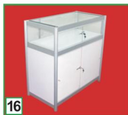
16 GLASS SHOWCASE 95(L) x 50(W) x 100 (H)cm