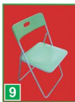
9 FOLDING CHAIR 40(W) x 40(D) x 45(H)cm