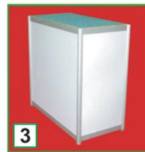
3 DISPLAY COUNTER 100(L) x 50(W) x 100(H)cm