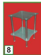
8 COFFEE TABLE (GLASS TOP) 108 (L) x 60 (W) x 45(H)cm