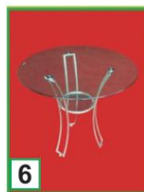
6 ROUND TABLE (GLASS TOP) 80(D) x 75(H)cm