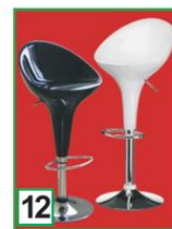
12 BAR STOOL 40(W) x 45(D) x 80(H)cm