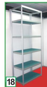
18 DISPLAY RACK WITH WOODEN SHELVES 50(L) x 100(W) x 240 (H)cm