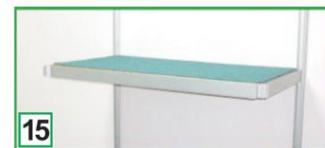
15 SYSTEM SELF (WOODEN / GLASS) 100(L) x 50(W)cm