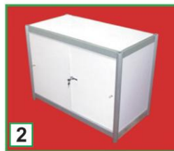
2 LOCKABLE COUNTER 100(L) x 50(W) x 75(H)cm